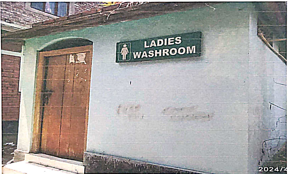
Ladies Wash Rooms